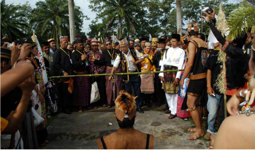
The Third Congress of the Indigenous Peoples Alliance of the Archipelago (KMAN III)