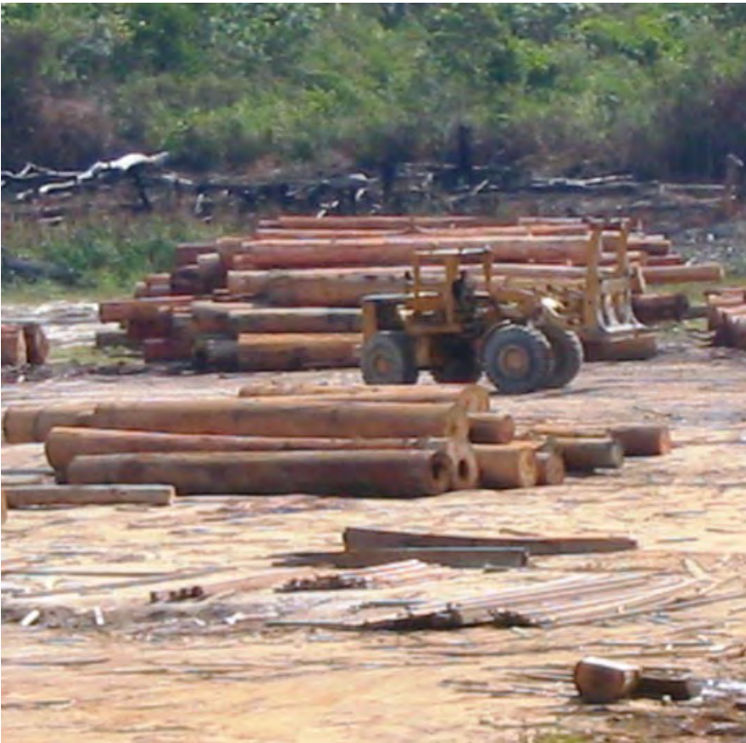
Logging concession in West Kalimantan

For nearly two decades, the Indonesian forestry department claimed 144 million hectares of forest lands as ‘state forest’. This was divided up into four categories. Production Forest (64 million ha) was intended for selective logging as part of the permanent forest estate. Another 31 million ha of so-called Conversion Forest was destined to be clear felled for agriculture, settlements or non-forestry uses. Protection Forest covering 39 million ha, mainly on high land or steep slopes, was to be retained for watershed protection. Protected Forests (19 million ha) included National Parks and Nature Reserves where forest exploitation was forbidden 4 .